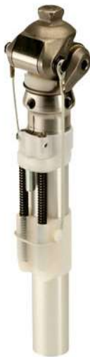
Extension Assist (3R15)