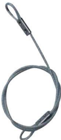
Extension Assist Cable (3R15)